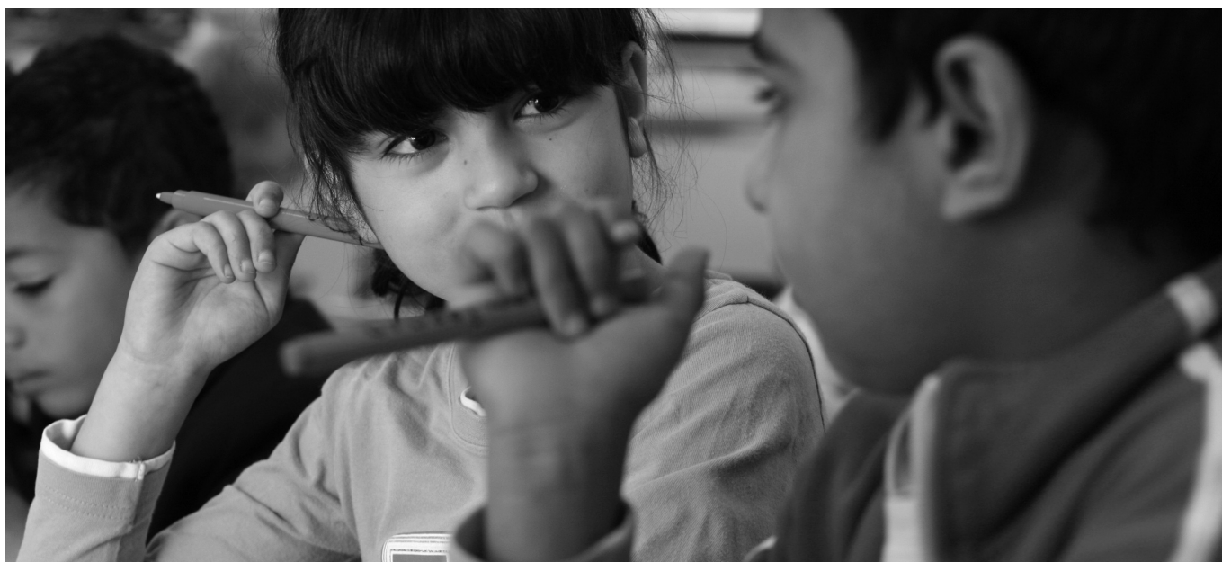
Crispin Hughes / Oxfam

Education for Global Citizenship enables pupils to develop the knowledge, skills and values needed for securing a just and sustainable world in which all may fulfil their potential.